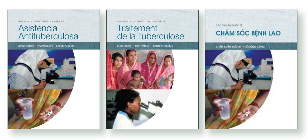
FIGURE 1. The ISTC translated into Spanish, French, and Vietnamese