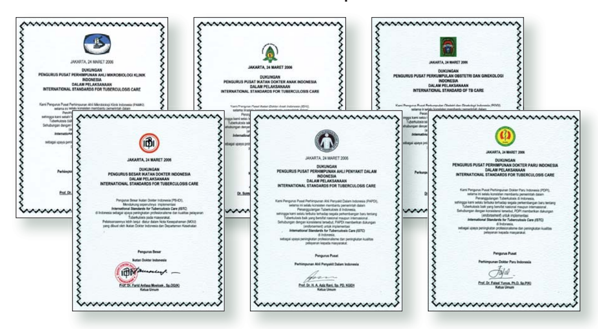
FIGURE 2. Endorsement letters from professional societies in Indonesia

Professional societies and their leaders are often important members of the private medical community, have direct access to a large number of practicing clinicians, and have influence that extends beyond their membership.