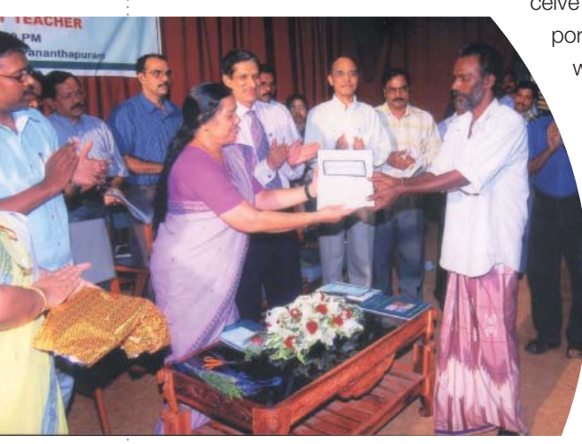
Minister of Health, Kerala State, India receiving a copy of the Patients' Charter in the local language from a patient

ceive care that is in conformance with the ISTC . Patients' awareness of and support for the ISTC and the Charter can be used to provide leverage in dealings with policy makers and funding agencies, empowering them to be effective advocates for high-quality tuberculosis care.